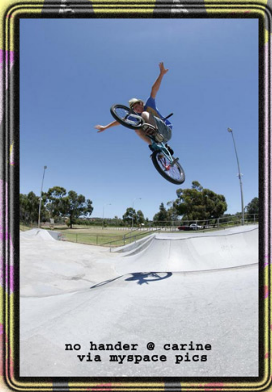
no hander @ carine via myspace pics

What was the most money you got for washing windows at one given time? Carine shops year 6 i think it was about 15 bucks